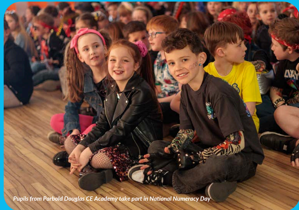
Pupils from Parbold Douglas CE Academy take part in National Numeracy Day