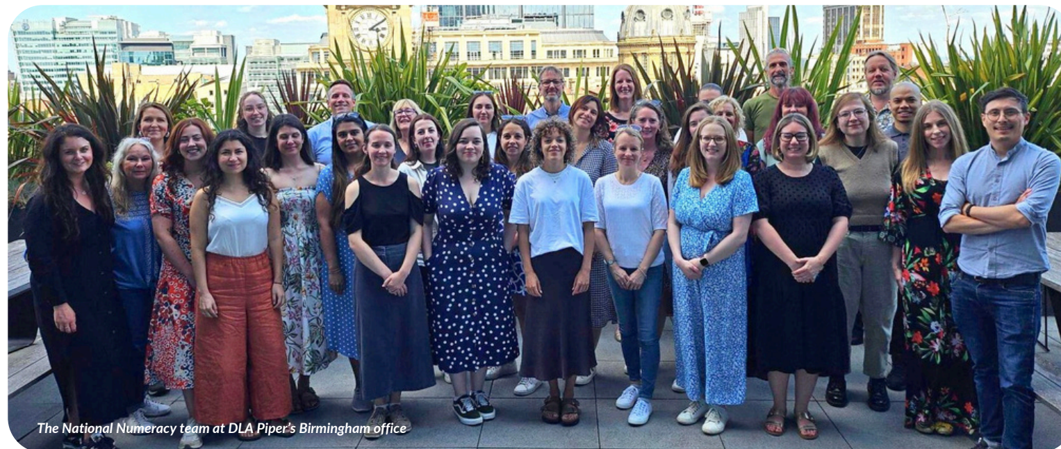
The National Numeracy team at DLA Piper's Birmingham office

[5] National Numeracy (2024). Young adults suffering poor mental health due to lack of maths: https://www.nationalnumeracy.org.uk/news/young-adults-poor-mental-health-due-lack-maths