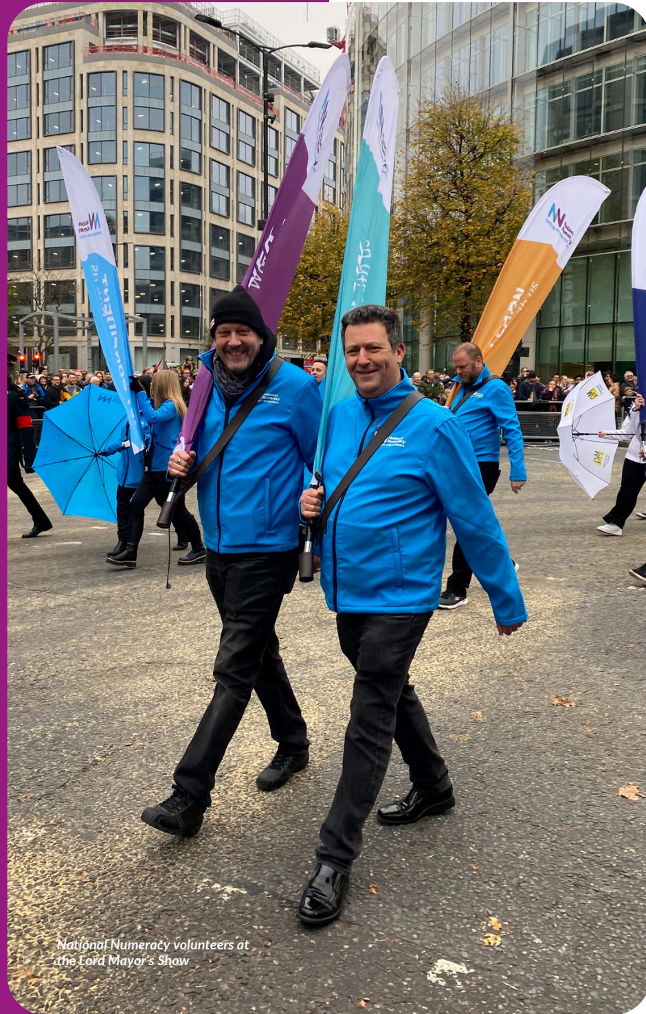
National Numeracy volunteers at the Lord Mayor's Show

National Numeracy worked with local authorities on their Multiply adult numeracy programmes, connecting with many local communities.