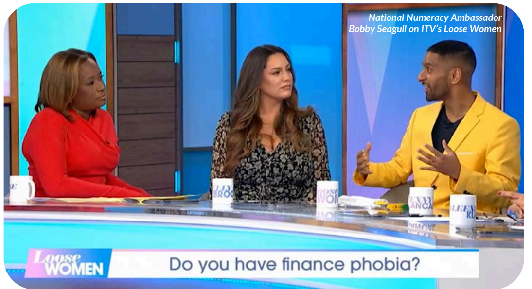
National Numeracy Ambassador Bobby Seagull on ITV's Loose Women