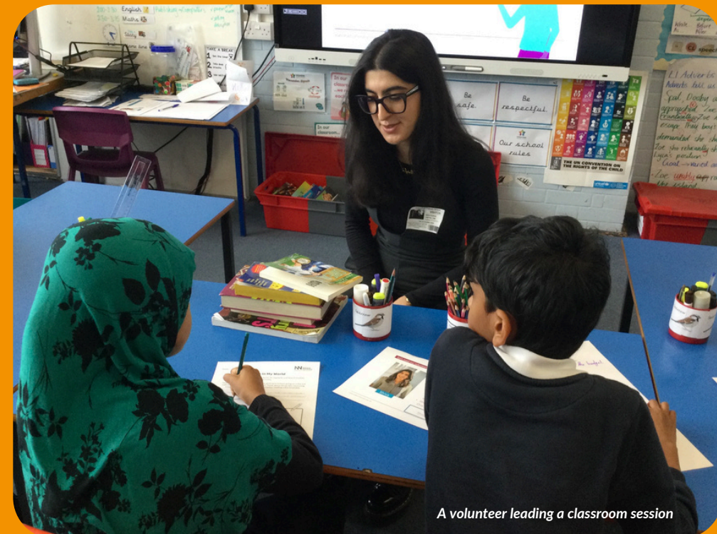
A volunteer leading a classroom session

Overall, disadvantaged children fall ten months behind their wealthier peers in maths by age 11. [4] Of the 106 schools we worked with in 2024, 58% were in the top 50% of wards with greater need (according to the UK Numeracy Index ).