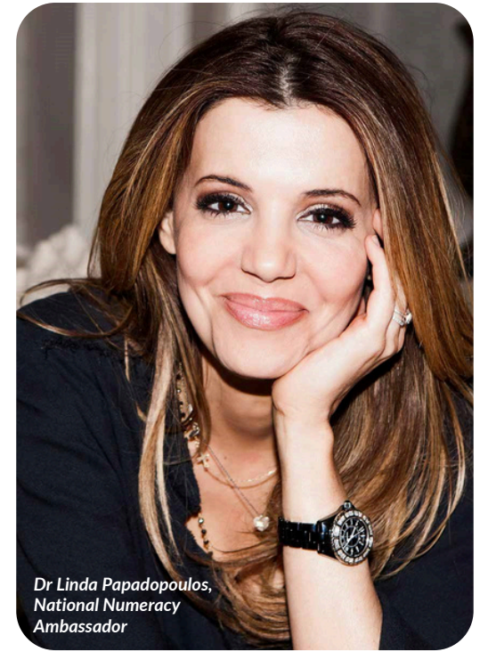
Dr Linda Papadopoulos, National Numeracy Ambassador

Plus, in 2024, we collaborated with one of the nation's biggest soaps, EastEnders! National Numeracy advised the writing team at EastEnders on a dyscalculia storyline , underscoring our commitment to raising awareness of this often-overlooked learning difficulty and further cementing our role as the UK's leading charity for everyday maths.