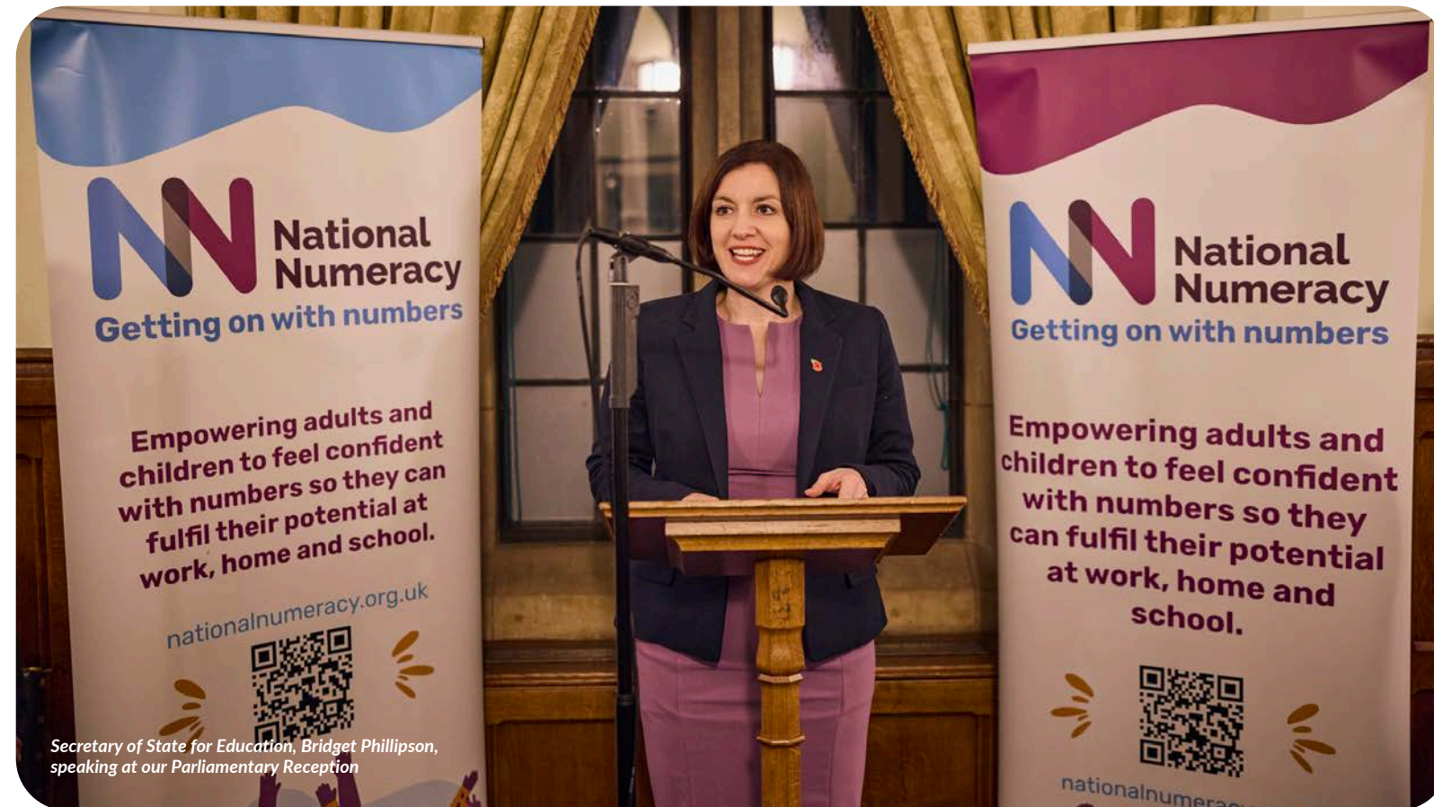
Secretary of State for Education, Bridget Phillipson, speaking at our Parliamentary Reception

Everyone has the opportunity to develop numeracy throughout life, regardless of socio-economic background or gender